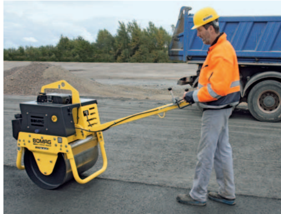
... and asphalt.