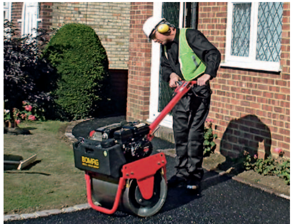
BW 55 E with special paint finish (optional).

Users worldwide trust the BOMAG name. The company has been a part of the FAYAT Group since 2005. BOMAG has six branches in Germany, eleven independent subsidiary companies and four production units across the globe. More than 500 dealers in over 120 countries provide global distribution of BOMAG equipment together with specialist service support.